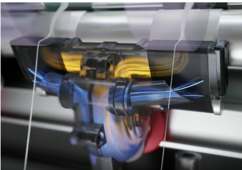
Fig. 4: The air barrier flow (blue) buffering the compacting air (yellow)

Developed to give customers a competitive edge, COMPACTapron benefits from a slimmer design significantly reducing spare parts costs: only the lattice aprons and cots must be changed. The lifetime of both cots and lattice aprons depends on the raw material, the climate, soilings and the application. Theoretically, lifetime similar to the lattice aprons used with EliTe can be expected.